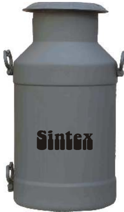
BMC Series Tuff Value for Money