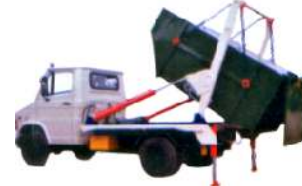
Single Dumper Placer Vehicle

Standard Colour : Black for Container System *Without chassis price