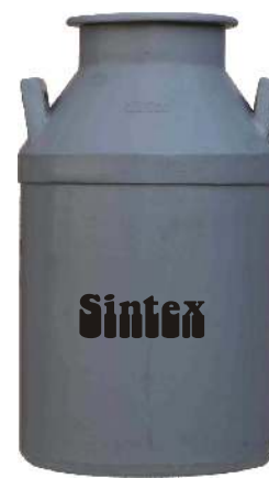
IMC Series Insulated All Weather Resistant