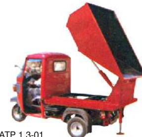
GATP 1.3-01 (3 Wheeler Auto Tipper)