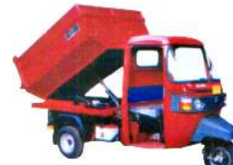
GATP 01-01 (3 Wheeler Auto Tipper)