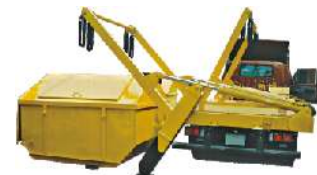
Twin Dumper Placer Vehicle