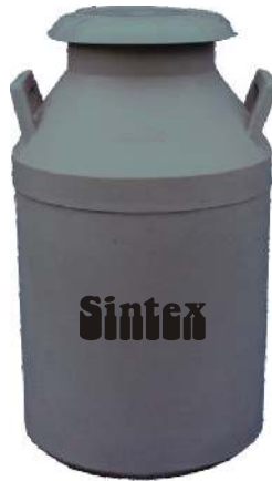
MC Series Popular Time-tested & Trustworthy